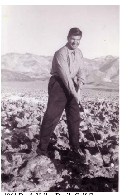
1961 Death Valley Devils Golf Course